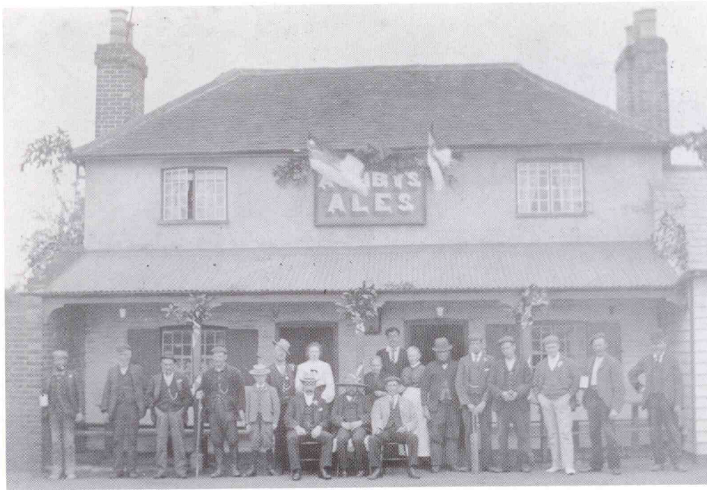
The ceremony 'Crowning of King Coffee' by patrons of the old 'Forest King' at Blackheath early 1900's.